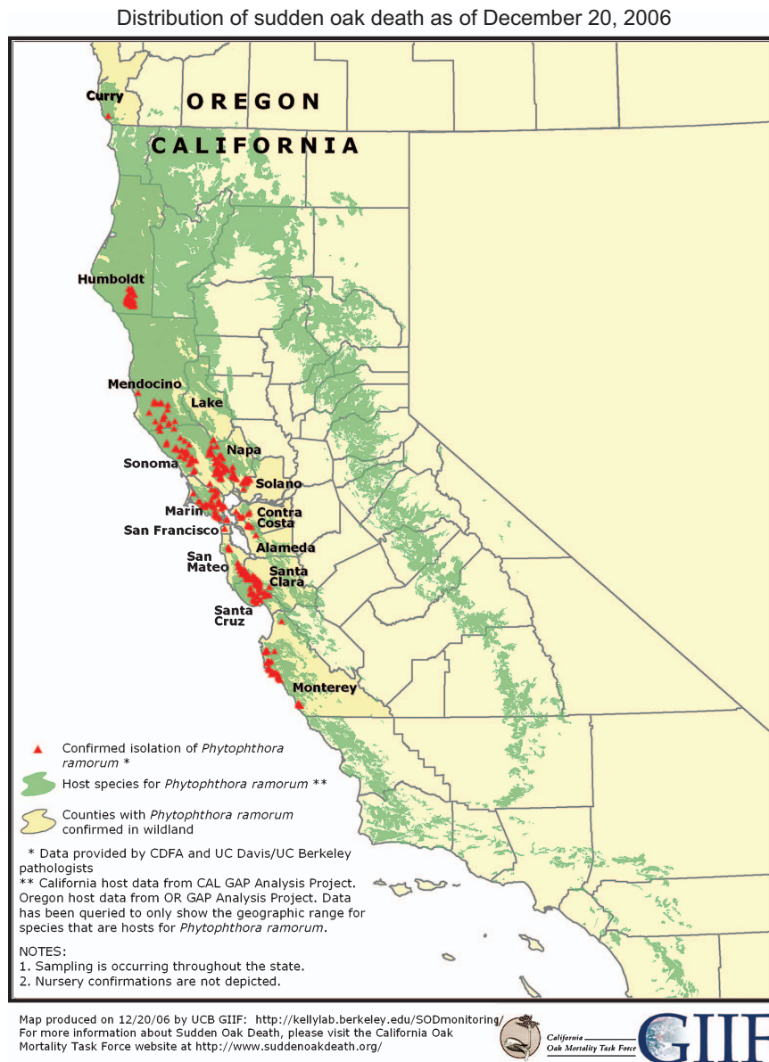
Fig. 1. Distribution of Phytophthora ramorum in wildlands in the United States.

Department of Food and Agriculture (CDFA) issued emergency regulations that restricted the export of diseased oak products and rhododendrons from each of the seven infested counties. The USDA APHIS followed by issuing an interim federal regulation (7 CFR Part 301) on 14 February 2002 for domestic interstate movement of P. ramorum host material from the CA counties known to be infested. International regulations were also enacted, with the European Union (EU) adopting emergency measures (2002/757/EC), as well as Canada, the UK, South Korea, New Zealand, Australia, the Czech Republic, Mexico, Taiwan and the US. (Kliejunas 2007).